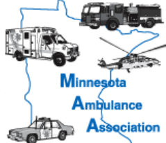
Representing Minnesota's EMS Professionals